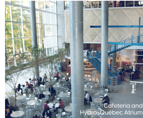
Cafeteria and Hydro-Québec Atrium