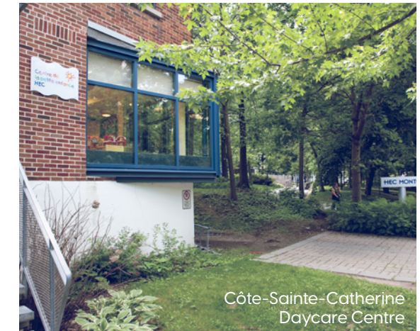
Côte-Sainte-Catherine Daycare Centre