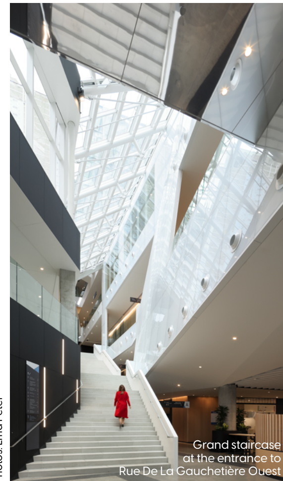
Grand staircase at the entrance to Rue De La Gauchetière Ouest