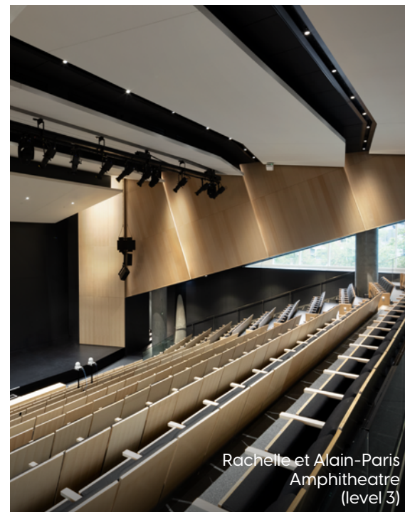
Rachelle et Alain-Paris Amphitheatre (level 3)