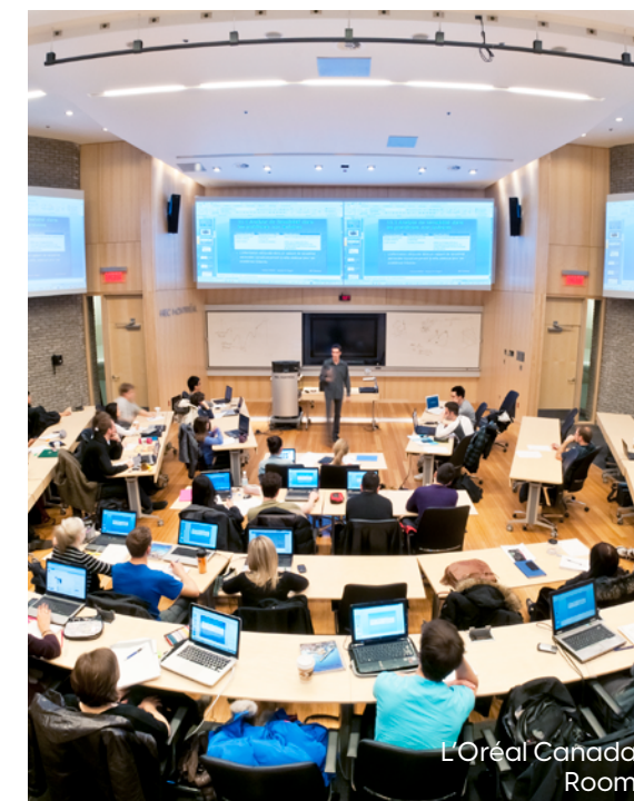
L'Oréal Canada Room