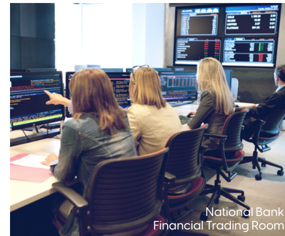
National Bank Financial Trading Room