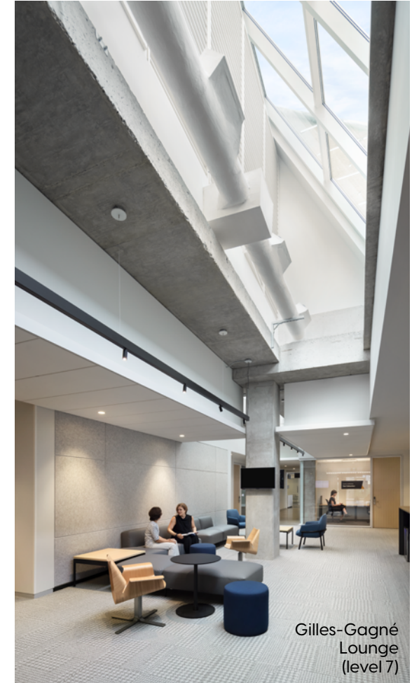
Gilles-Gagné Lounge (level 7)