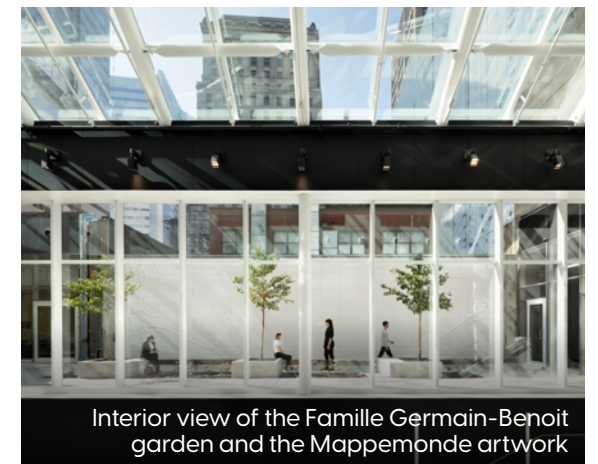
Interior view of the Famille Germain-Benoit garden and the Mappemonde artwork