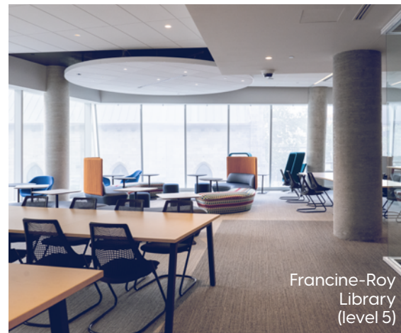
Francine-Roy Library (level 5)