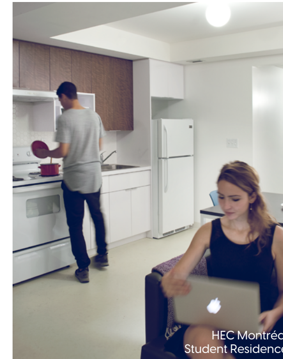
HEC Montréal Student Residence

Full-time students can join one of the teams of the Université de Montréal's sports excellence program, the Carabins, representing the university on the provincial and national scenes.