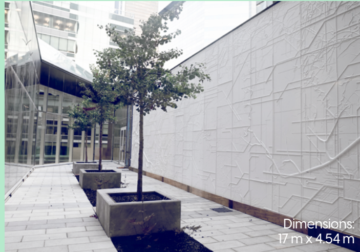
Dimensions: 17 m x 4.54 m

Two creations by world-renowned Quebec artists who promote public art were chosen to energize the space and architecture of the building: