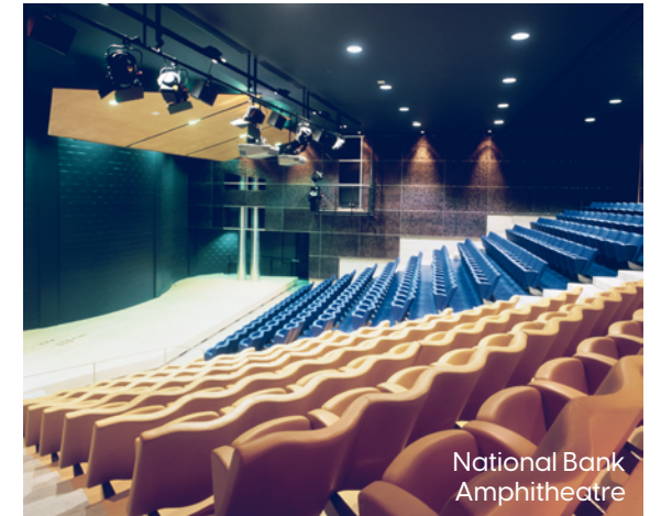
National Bank Amphitheatre