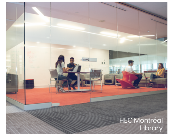
HEC Montréal Library