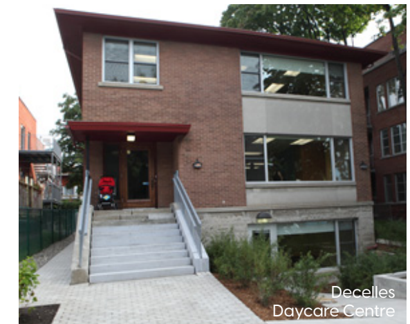
Decelles Daycare Centre