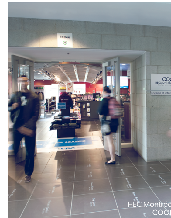
HEC Montréal COOP