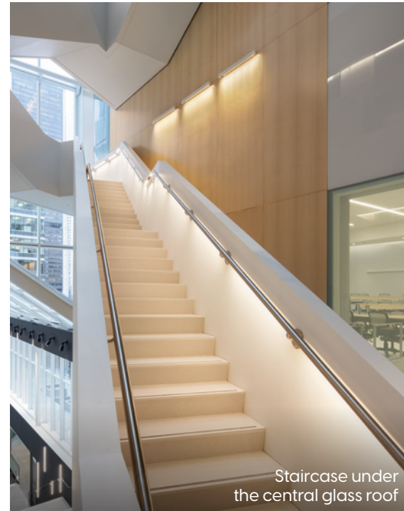
Staircase under the central glass roof