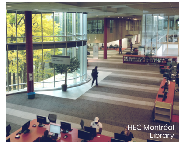
HEC Montréal Library