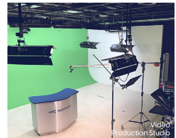
Video Production Studio