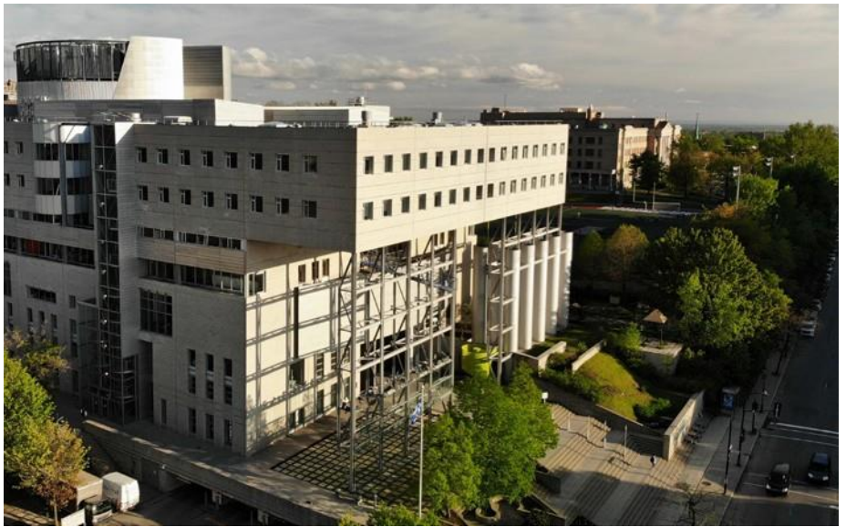
HEC Montréal—Campus Côte-Sainte-Catherine